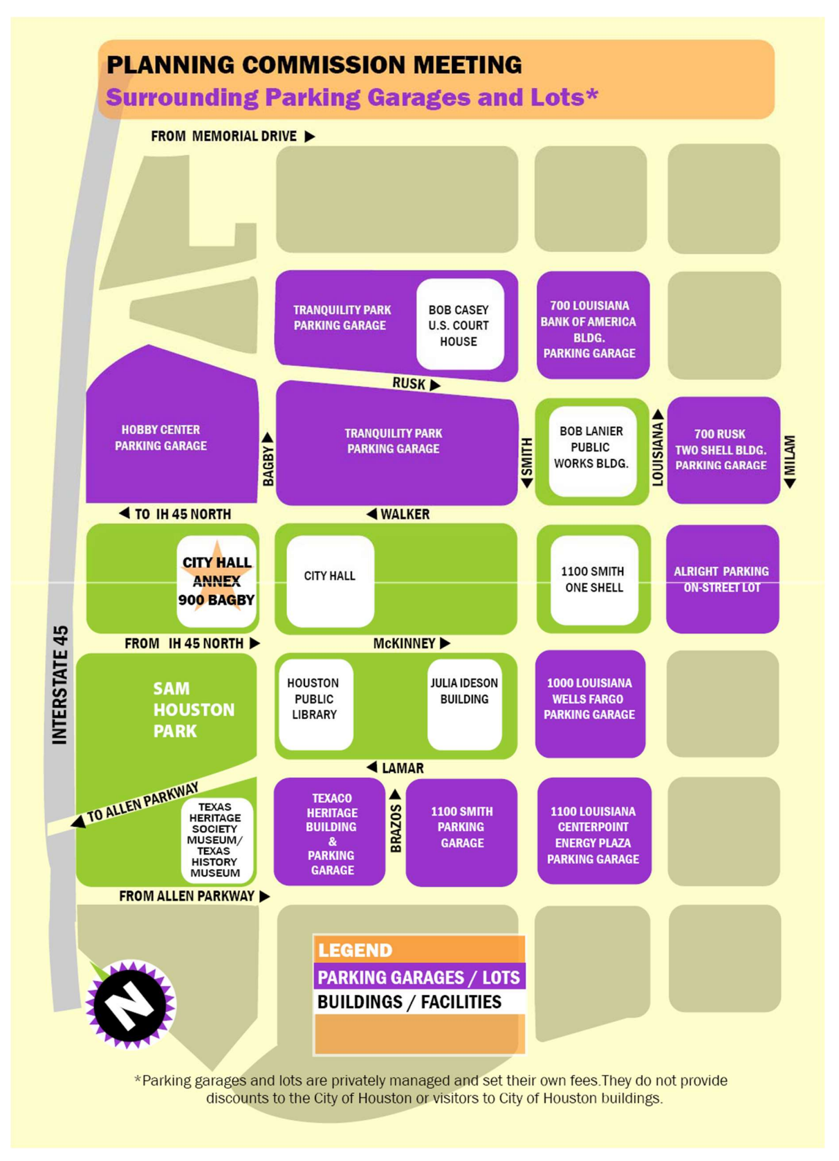
Appendix F (Planning Commission Parking Map)